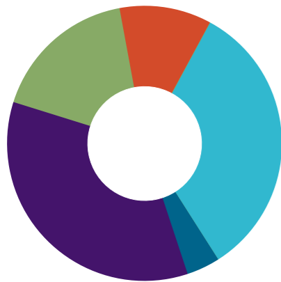
Israel Project Grants Expenditure 2013 by Theme (Total £929,686) Shatil 11% Civil & Human Rights 33% Religious Pluralism & Tolerance 4% Social & Economic Justice 35% Environment 17%