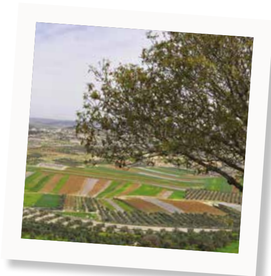
EQUAL REPRESENTATION: SUPREME COURT ORDER MANDATES FAIR REPRESENTATION OF WOMEN AND ARABS ON THE ISRAEL LAND AUTHORITY COUNCIL, FOLLOWING A PETITION BY ACRI AND ITACH-MAKI (WOMEN LAWYERS FOR SOCIAL JUSTICE)