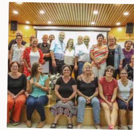
BRIDGING THE HEALTHCARE GAPS: ALUMNA OF A SHATIL LEADERSHIP PROGRAMME FORMED THE NORTHERN HEALTH EQUITY LEADERSHIP NETWORK TO BRIDGE HEALTHCARE GAPS BETWEEN THE NORTH AND CENTRE OF ISRAEL