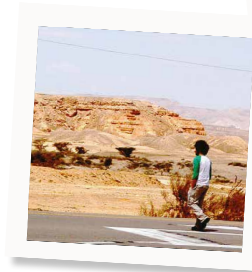
NEGEV COUNCIL LAUNCHED: SHATIL PLAYED A KEY ROLE IN BRINGING TOGETHER MAYORS WITH BUSINESS AND COMMUNITY LEADERS TO WORK FOR A BETTER FUTURE FOR THE NEGEV