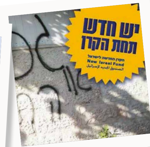
COMPENSATION FOR "PRICE TAG" VICTIMS: NEW LEGISLATION ENTITLES ARAB ISRAELIS TO COMPENSATION FOR PROPERTY DAMAGED IN A "PRICE TAG" ATTACK, FOLLOWING A CAMPAIGN LED BY THE COALITION AGAINST RACISM