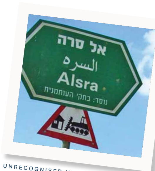
UNRECOGNISED VILLAGE SAVED FROM DEMOLITION: 350 BEDOUIN FAMILIES REMAIN IN THEIR HOMES, FOLLOWING AN 8-YEAR STRUGGLE BY ADALAH TO CANCEL DEMOLITION ORDERS

2014 was an important year for NIF, with numerous landmark victories. Whether advocating for policy change, defending rights through the courts or empowering communities through grassroots programmes, this year NIF contributed to essential change on the ground in Israel. Here are some snapshots of our achievements: