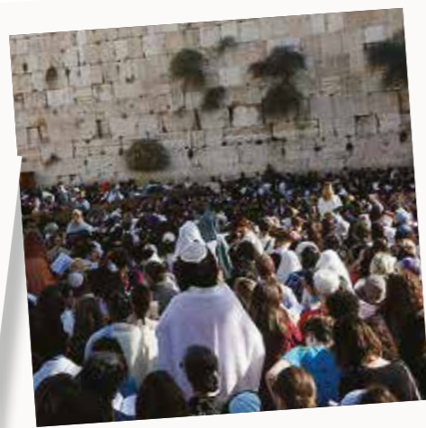
STATE SALARIES FOR NON-ORTHODOX RABBIS: GOVERNMENT PAID SALARIES OF REFORM RABBIS FOR THE FIRST TIME, DUE TO CAMPAIGNING BY ISRAELI RELIGIOUS ACTION CENTRE (IRAC)