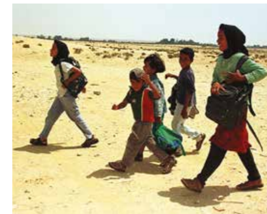
Children of unrecognized Bedouin villages in the Negev were particularly vulnerable during Operation Protective Edge

"We went... as an act of religious obligation and humanistic solidarity. Our visit was warmly received by our Palestinian neighbours who were visibly moved by our empathetic act of good will." As the war raged, Tag Meir visited the hospital beds of Jewish and Arab victims of hate crimes, ran ad-hoc peace rallies and tolerance spreading activities across the country. Through the war and in its aftermath, NIF supported these and many other shared society initiatives to address the enormous tensions and distrust between Jewish and Arab Israelis that the war exposed.