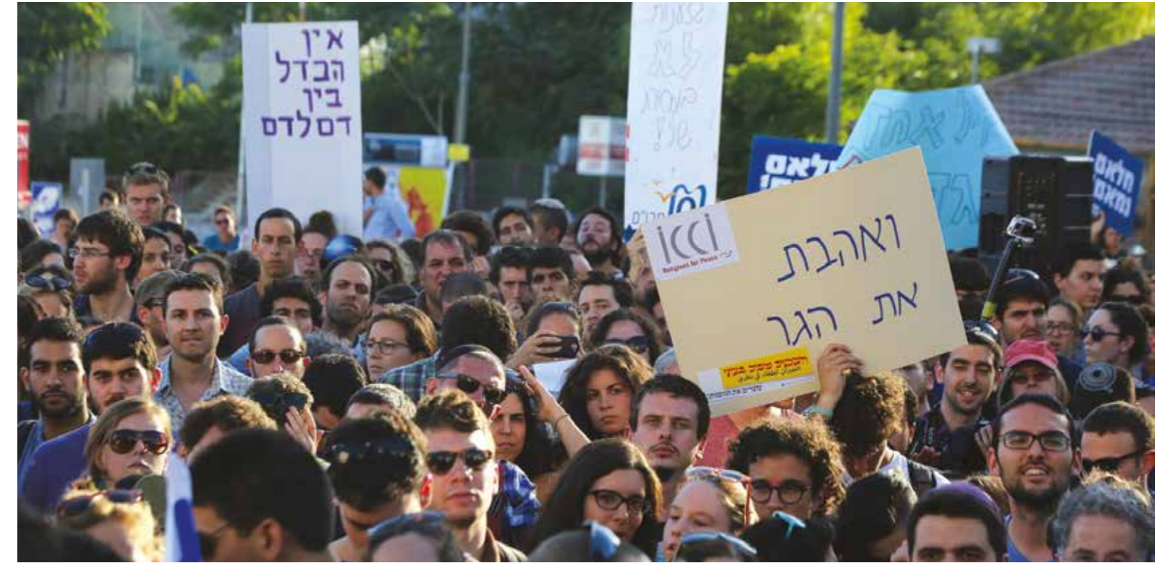
Demonstrators hold up signs stating "there is no difference between blood and blood", and "and you shall love the stranger" at a demonstration calling for tolerance and calm as tensions mounted in the run up to Operation Protective Edge