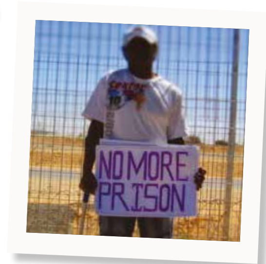
COURT VICTORY FOR AFRICAN REFUGEES: 180 ASYLUM SEEKERS WERE RELEASED FROM MONTHS AND EVEN YEARS OF DETENTION, IN A LANDMARK LEGAL VICTORY FOR HOTLINE FOR REFUGEES AND MIGRANTS AND 4 OTHER NIF GRANTEEES