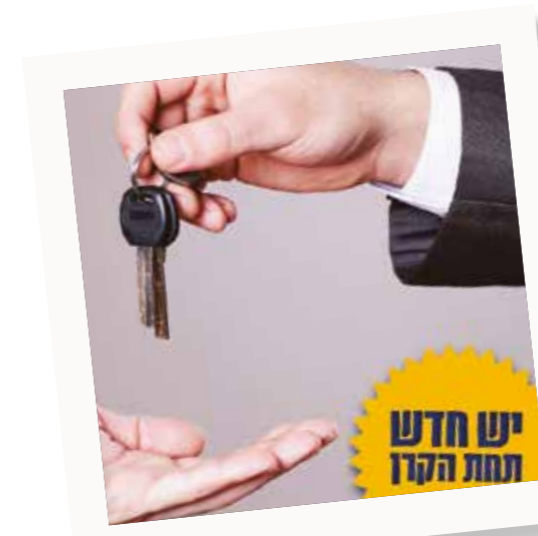
HOUSING POLICY PROGRESS: 25% OF UNITS IN ALL MAJOR BUILDING PROJECTS WILL NOW BE AFFORDABLE, THANKS TO THE EFFORTS OF THE COALITION FOR AFFORDABLE HOUSING