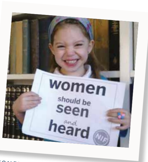
WOMEN SHOULD BE SEEN AND HEARD: ULTRA-ORTHODOX RADIO STATION KOL BARAMA CAN NO LONGER EXCLUDE WOMEN FROM BROADCASTS, THANKS TO IRAC'S LEGAL CAMPAIGN