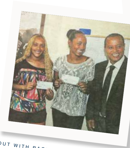
OUT WITH RACISM: NIF GRANTEE TEBEKA SECURED COMPENSATION FOR TWO ETHIOPIAN-ISRAELI WOMEN WHO WERE REFUSED ENTRY TO A NIGHTCLUB