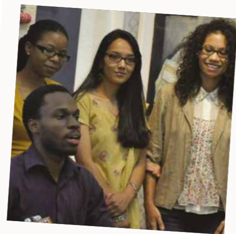
MAJOR ARAB-JEWISH FESTIVAL LAUNCHED: MORE THAN 1,000 ARABS AND JEWS CELEBRATED EACH OTHER'S CULTURES AND SHARED DIFFICULT MEMORIES AT THE HAIFA STORIES FESTIVAL PRODUCED BY SHATIL AND HAIFA'S ARAB-JEWISH CENTRE, BET HAGEFEN