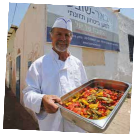
ENSURING FOOD SECURITY DURING THE WAR: FOOD SECURITY NGO BE'ER SOVA FED HUNDREDS IN THE SOUTH DURING THE WAR WITH A FREE RESTAURANT AND DELIVERIES TO THOSE AFRAID TO LEAVE HOME