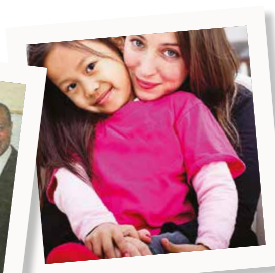
CHILDREN OF MIGRANT WORKERS PROTECTED: A MULTI-YEAR EFFORT BY HOTLINE FOR REFUGEES & MIGRANTS AND ISRAELI CHILDREN WON THE RIGHT FOR 221 CHILDREN TO STAY IN ISRAEL, THE ONLY HOME THEY'VE EVER KNOWN