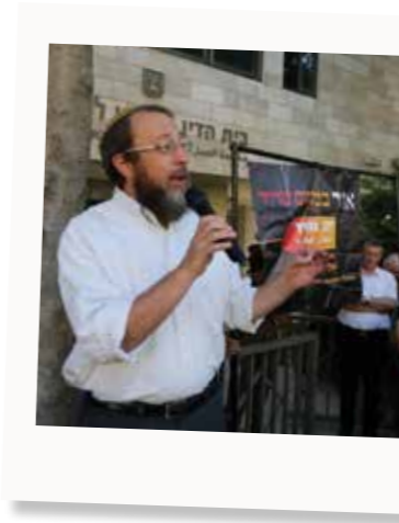
PRICE TAG ATTACKS FINALLY CURBED: WE SAW A DRAMATIC DROP IN VIOLENCE BY PRO-SETTLEMENT GROUPS AGAINST PALESTINIANS, THE IDF AND HOLY SITES FOLLOWING GREATER LAW ENFORCEMENT. THIS RESULTED FROM CONSISTENT PRESSURE BROUGHT BY THE NIF-CONVENED TAG MEIR COALITION