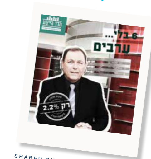
SHARED PUBLIC SPACE: WE SAW SIGNIFICANT PROGRESS TO CREATE THE MEDIA AS A SHARED PUBLIC SPACE. SIKKUY'S TARGETED INTERVENTION MORE THAN DOUBLED THE PERCENTAGE OF ARAB VOICES ON NEWS PROGRAMMES