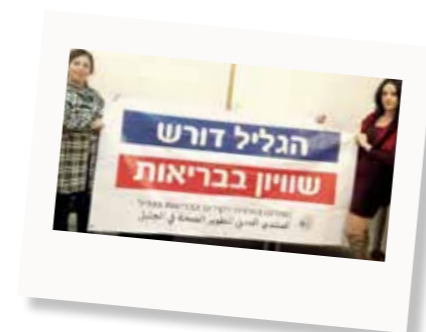
MAJOR VICTORY FOR HEALTHCARE: THE ARAB-JEWISH CITIZENS FORUM FOR THE PROMOTION OF HEALTH IN THE GALILEE WAS CITED AS THE REASON FOR THE GOVERNMENT ALLOCATING NIS 930 MILLION TO IMPROVE HEALTH SERVICES IN NORTHERN ISRAEL.