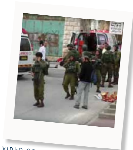
VIDEO SPARKS NATIONAL DEBATE: A PUBLIC CONVERSATION ABOUT MORALITY AND THE IDF CONSUMED ISRAEL, PROMPTED BY B'TSELEM'S VIDEO SHOWING AN ISRAELI SOLDIER SHOOTING A SUBDUED PALESTINIAN TERRORIST