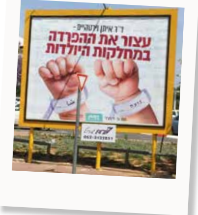
REJECTING SEGREGATION IN HOSPITALS: FOLLOWING A RADIO EXPOSE ON ETHNIC SEGREGATION IN MATERNITY WARDS, ZAZIM LAUNCHED AN ONLINE AND BILLBOARD CAMPAIGN. THE CAMPAIGN'S IMPACT INCLUDED MEIR HOSPITAL ANNOUNCING IT WOULD END SEGREGATION