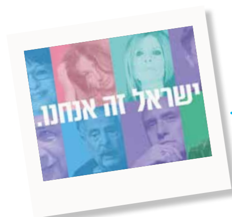
"WE ARE ISRAEL": NIF'S CAMPAIGN AGAINST INCITEMENT IN ISRAELI SOCIETY AND CELEBRATION OF DEMOCRACY REACHED OVER 660,000 ISRAELIS