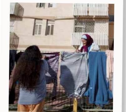
CLOSING GAPS: YEARS OF ADVOCACY, ORGANISED IN PART BY SIKKUY , LED TO THE CABINET'S APPROVAL OF A NIS 10-15 BILLION PLAN TO HELP EQUALISE INVESTMENT IN EDUCATION, WELFARE, HOUSING AND TRANSPORTATION FOR ISRAELI ARABS