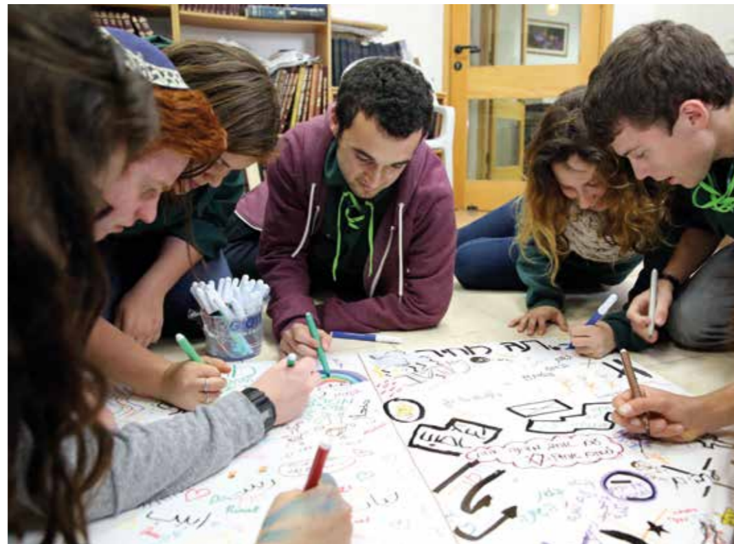
Youth movement leaders making anti-racism posters.