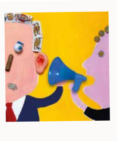
"FEEL FREE TO CRITICISE": SHATIL'S FORUM FOR FREEDOM OF SPEECH AND PROTEST BRINGS TOGETHER OVER 100 LEADERS TO WORK TOGETHER TO CREATE INNOVATE METHODS AND PUBLIC CAMPAIGNS TO PROMOTE DEMOCRATIC FREEDOMS