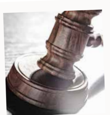
CRACKING THE GLASS CEILING: FOLLOWING WORK FROM MAVOI SATUM WOMEN ARE NO LONGER EXCLUDED FROM SERVING IN SENIOR POSITIONS OF THE RABBINIC COURTS