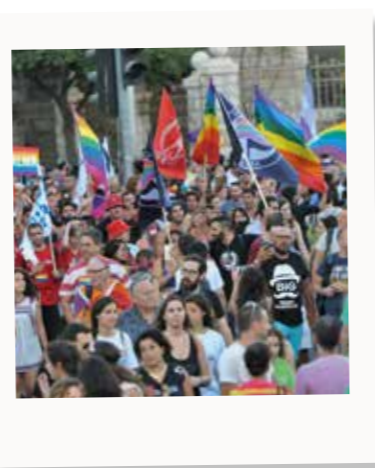
JERUSALEM MARCH FOR PRIDE AND TOLERANCE: A RECORD 25,000 MARCHERS WALKED THE STREETS OF JERUSALEM STANDING UP FOR LGBTQ RIGHTS. IT BROUGHT TOGETHER ISRAELIS ACROSS RELIGIOUS AND COMMUNITY LINES TO REJECT THE VOICES OF RELIGIOUS EXTREMISM