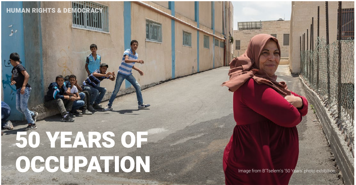
Image from B'Tselem's '50 Years' photo exhibition.