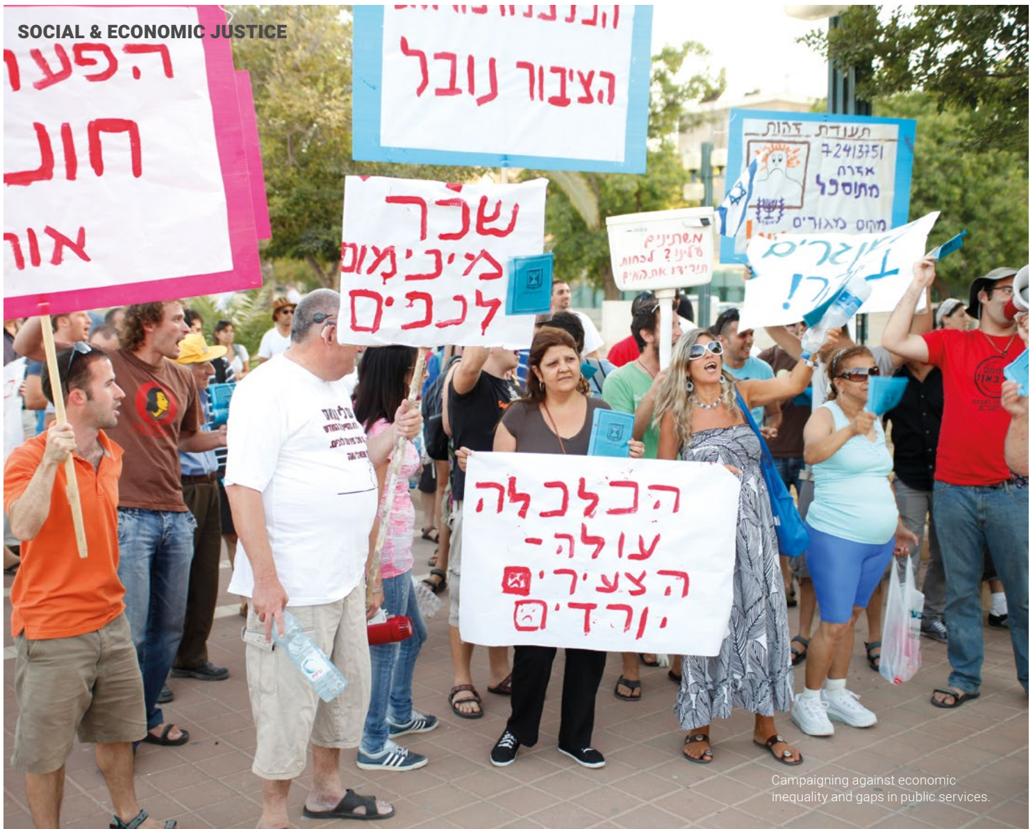
Campaigning against economic inequality and gaps in public services.