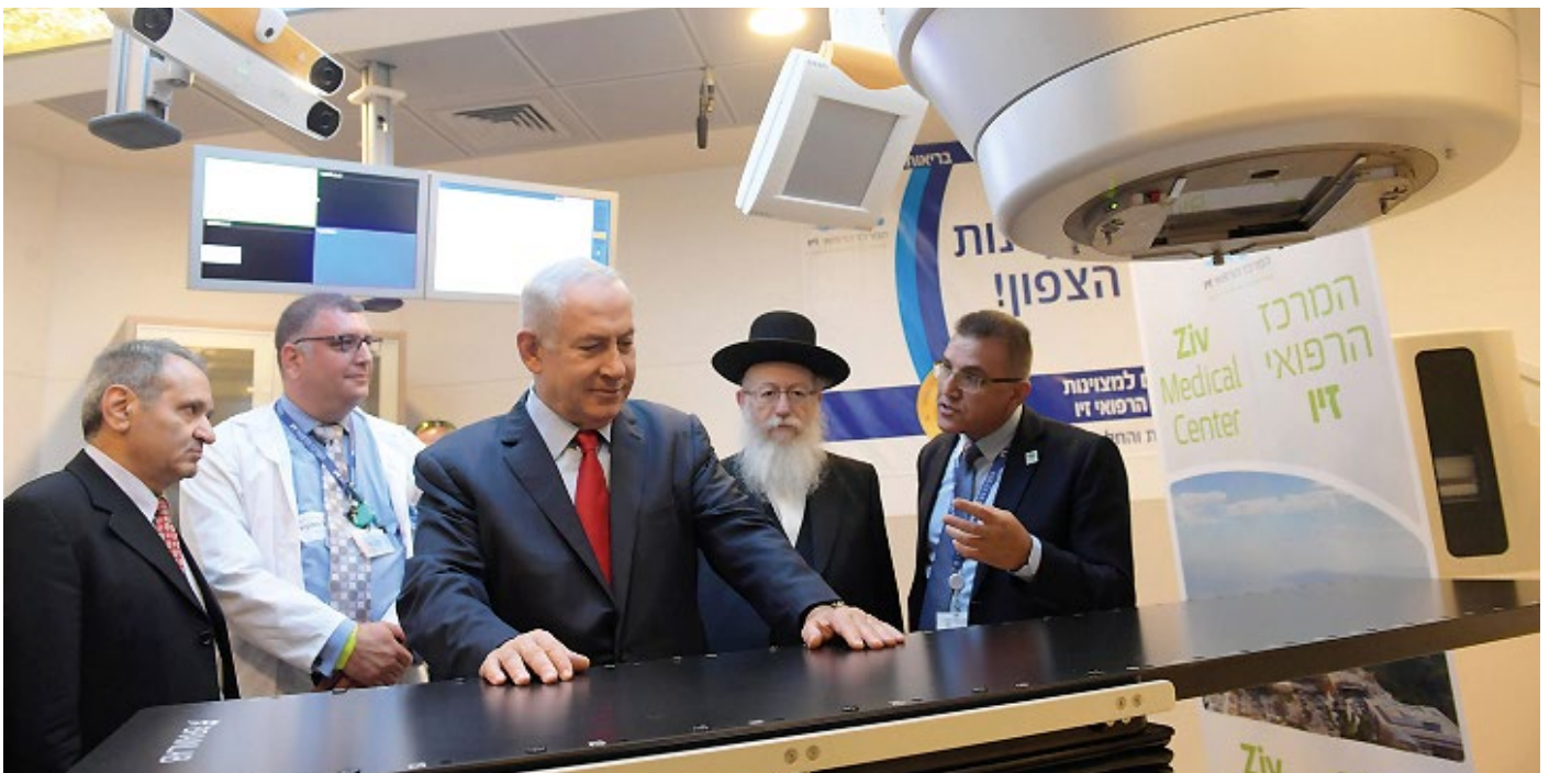
Image below: A new radiotherapy unit is opened by Prime Minister Benjamin Netanyahu and Health Minister Yaakov Litzman at Ziv Hospital in Tzfat.