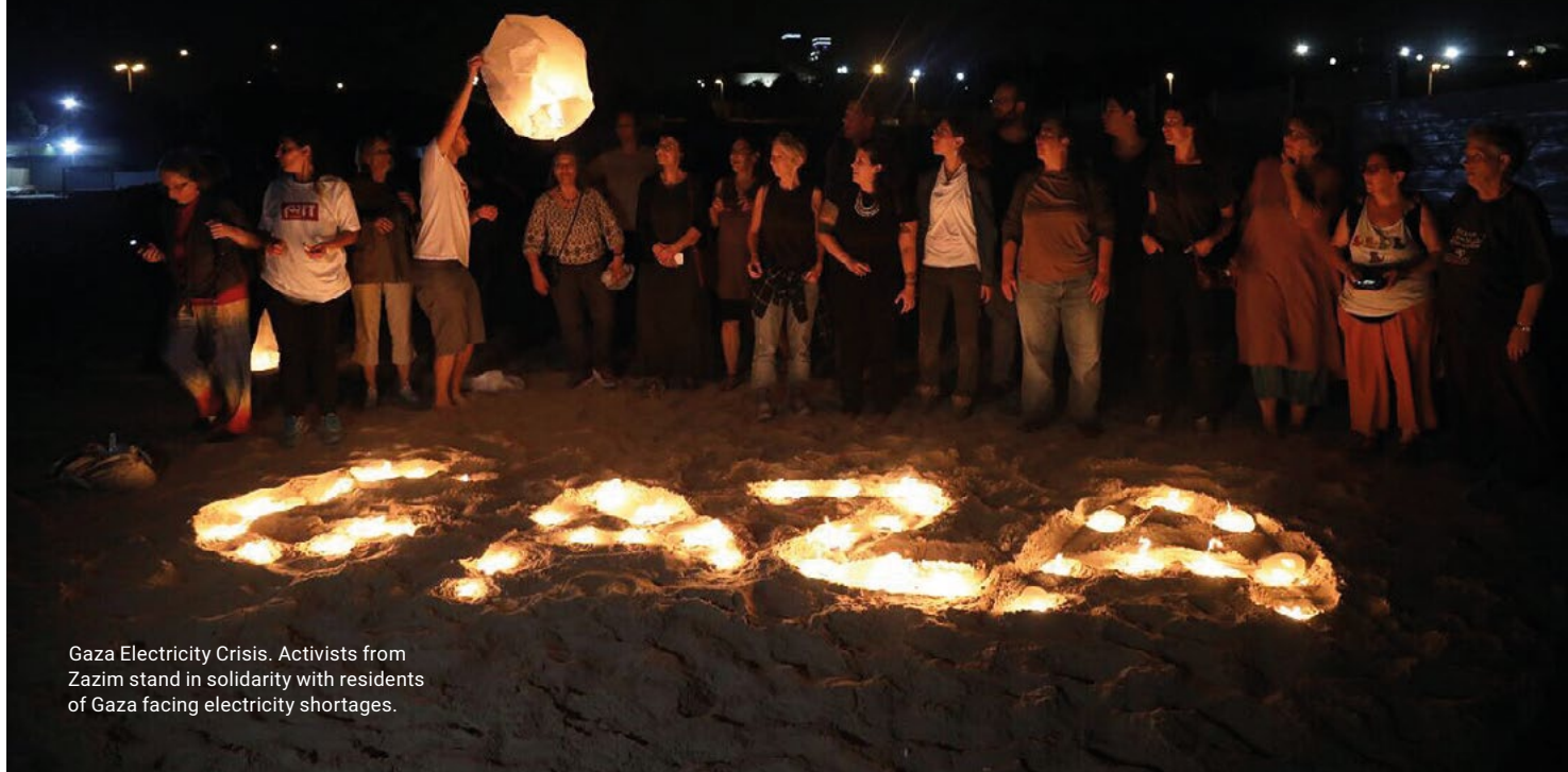
Gaza Electricity Crisis. Activists from Zazim stand in solidarity with residents of Gaza facing electricity shortages.

news', concerns have been raised regarding levels of misinformation and political bias in the Israeli media. In July 2017, NIF seed-funded charity, The Whistle, was launched. The Whistle is designed to hold Israel's media accountable for its coverage. The Whistle's team of researchers and journalists monitors and reports the media and at the same time works to build public engagement and support on this issue. With Israel's press demoted for the first time ever to 'partly free' (Freedom House, 2016) the need for factually accurate and unbiased reporting has never been greater.